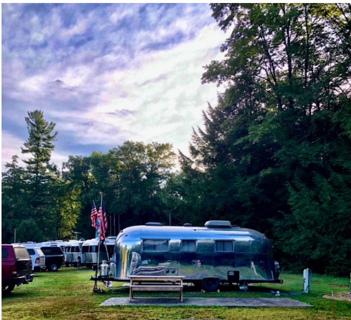
Vintage Airstream Among Newer Rally Group