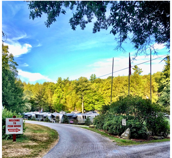
Beautiful Blue Sky on Rally Weekend