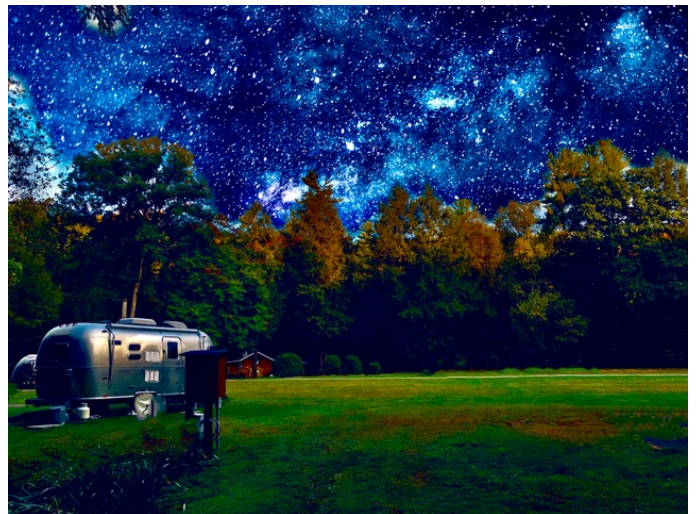
Starry, Starry Night at the Rally Field