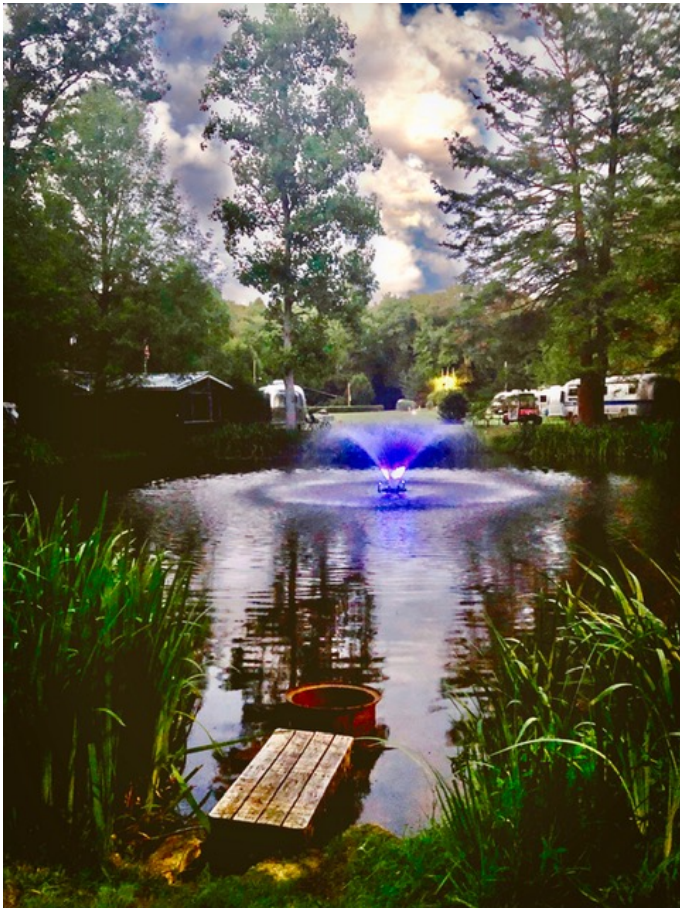
Hayes Pond at Penn Wood Campground