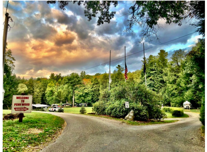
Penn Wood Entrance Road Under Captivating Sky

REMEMBER THAT WE ARE NOW NAMED "PENNSYLVANIA AIRSTREAM CLUB", WHICH IS STILL TECHNICALLY WBCCI'S UNIT 91.